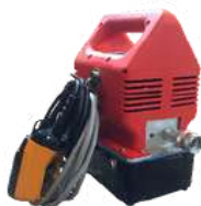
Mini Electric Pump (Ref. Page 32)