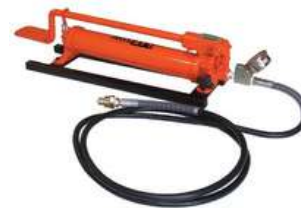
Foot Pump (Ref. Page 30)