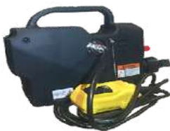
Battery operated pump (Ref. Page 32)